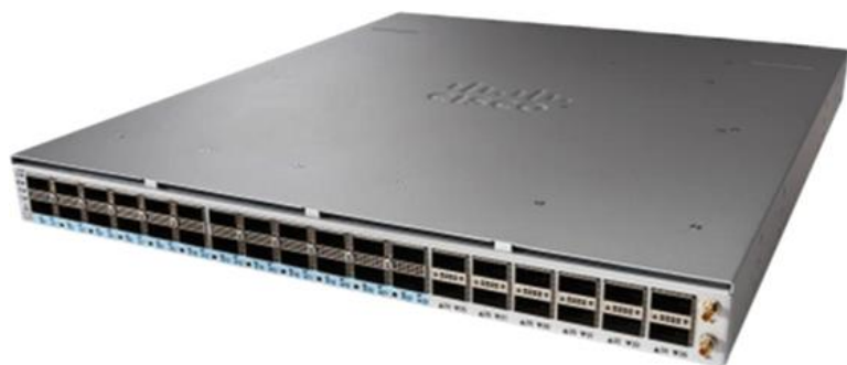
Figure 6. Cisco 8201-SYS