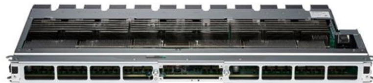
Figure 17. Cisco 8800 fabric card

The Cisco 8800 Series switch fabric is powered by 8 fabric cards that provide 7+1 line rate redundancy. In addition, the fabric supports a separate operational model with 4+1 fabric card redundancy to provide an entry level option for systems with only the 48-port 100GbE line card. This mode reduces cost and power for networks that want to take advantage of the latest platforms but are not yet ready to broadly deploy 400GbE.