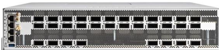
Figure 10. Cisco 8202-32FH-M

The Cisco 8200 Series is designed for roles requiring higher scale and external deep buffers. To achieve similar routed bandwidth and scale, other industry routers require multiple devices such as off-chip Ternary Content-Addressable Memory (TCAMs), fabric ASICs, and multiple network processors. However, the Cisco 8200 Series routers use a simple single ASIC (with HBM) design without the need for off-chip TCAM.