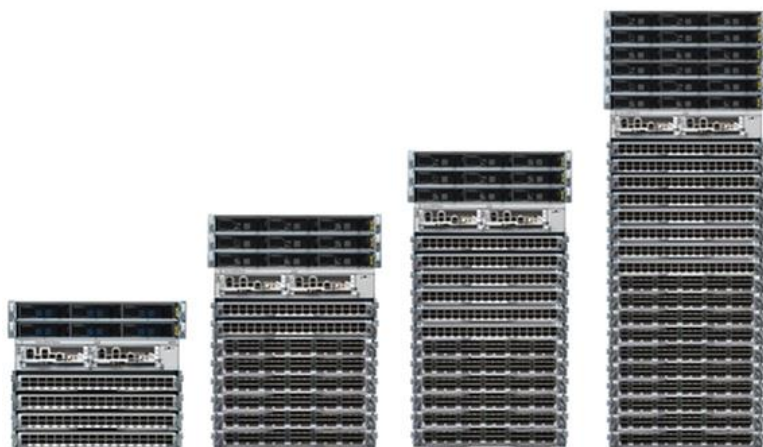
Figure 11. Cisco 8800 4-, 8-, 12-, and 18-slot modular chassis

With up to 518.4 Tbps via 648 800G (2x 400GbE) ports, the Cisco 8800 Series delivers industry leading breakthrough density and efficiency with the extensive scale, buffering, and feature capabilities common to all the Cisco 8000 Series of routers. It includes four chassis – the 8804, 8808, 8812, and 8818 – to meet a broad set of network and facility requirements.