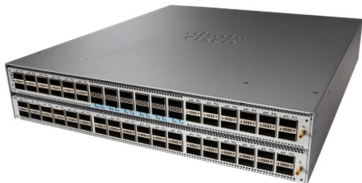
Figure 7. Cisco 8202-SYS