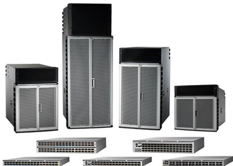
Figure 1. Cisco 8000 Series routers

High-performance networking systems have historically been divided into routing or switching classes, with distinct hardware and software. Over time, this distinction has become less pronounced. This convergence has occurred with the evolution of feature-rich switching chips and routing chips that balance traditional Service Provider (SP)-class capabilities with many benefits of switching Application-Specific Integrated Circuits (ASICs).