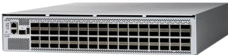
Figure 3. Cisco 8102-64H-O